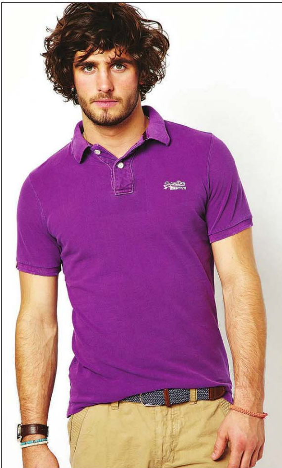
Stay stylishly cool in a coloured polo by Superdry.

Accessories are always an easy way to add some presence and update your wardrobe. Bags, ties, sunglasses, belts, hats, jewelry and watches are all great for showing off your personality