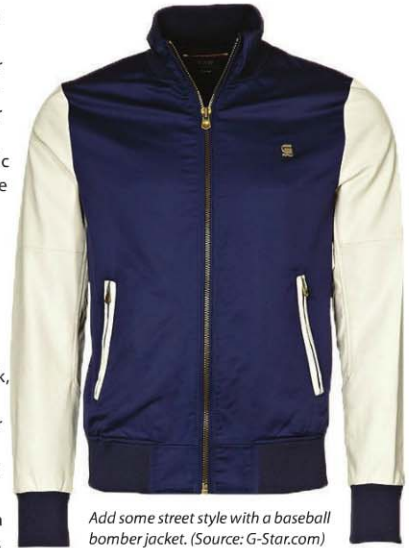
Add some street style with a baseball bomber jacket.

a boat were the stand-outs of their show. Baseball bomber jackets in bold metallic colours were showcased heavily on the runway at Burberry. But for a more daytime-friendly look, try a baseball bomber jacket in an earth-toned leather. It'll go well with most outfits since it