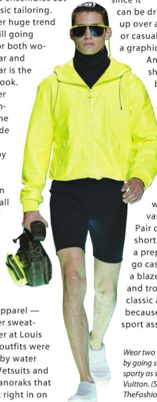
Wear two trends at once by going sockless and sporty as seen at Louis Vuitton.

More often than not, guys tend to play it safe in neutral coloured ensembles. Even the menswear runways were awash with shades of grey, navy and olive. But the warmer months are all about colour. Whether you're clothes shopping for yourself or a boyfriend, avoid the basic black, white or grey version and go